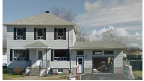
Building located at 610, boulevard Joliet in Baie-Comeau

The administrators have approved the sale of a single-family house located in Havre-Saint-Pierre, for $251 000. The sale price is based on the market value assessment of a real estate appraiser from the region.