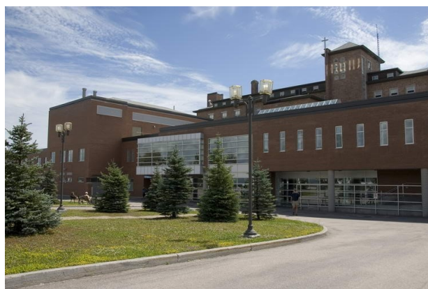
Hôpital Le Royer (Baie-Comeau)

Let us mention that, to comply with section 444.1 of the Act respecting health services and social services, every two years, the establishment must provide the minister of Health and Social services with a statement that its facilities and their capacity correspond to those specified on its operating licence.